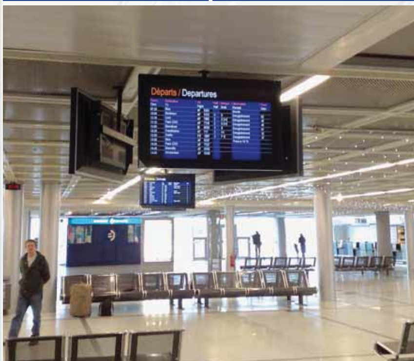
Nantes Airport / France