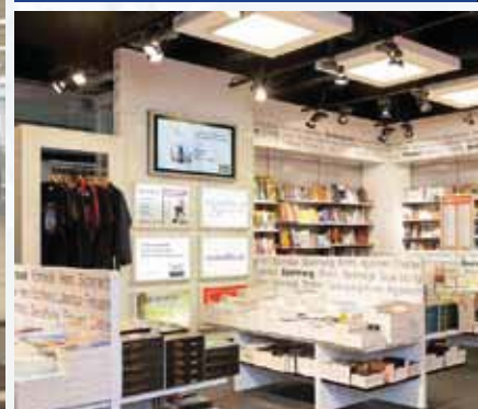
Book shop Hollmann, Duesseldorf / Germany