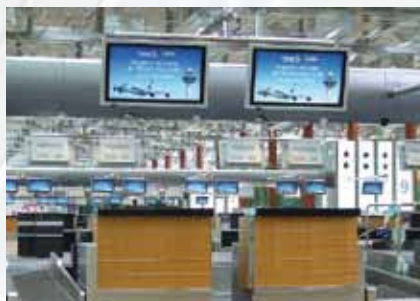
Changi Airport Singapore / Singapore