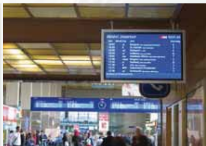
Vienna Train Station / Austria

The intelligent cooling system works in two cycles, an open loop and a closed loop. Despite the Public Displays' safety glass panel, it cools the TFT panel from front and back. Depending on the display size and its power consumption, one, two or more air ventilation ducts can be integrated. Furthermore, a special sealing method avoids dust accumulation inside the display. The cooling system is very energy efficient and maintenance-free, reducing the cost of ownership.