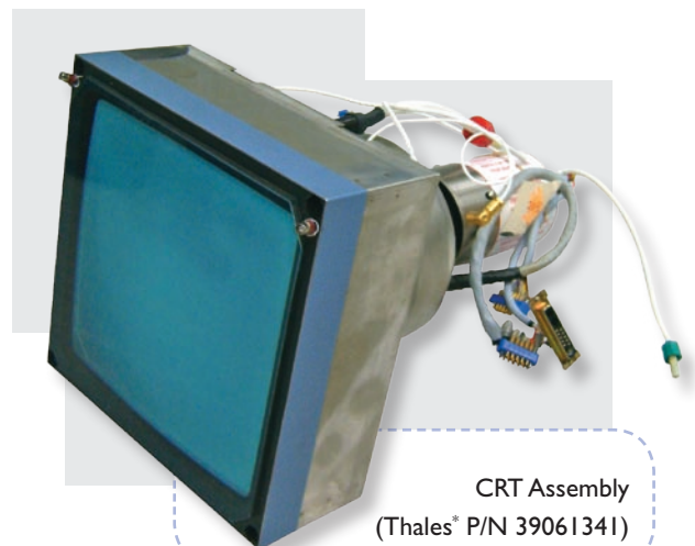
CRT Assembly (Thales* P/N 39061341)