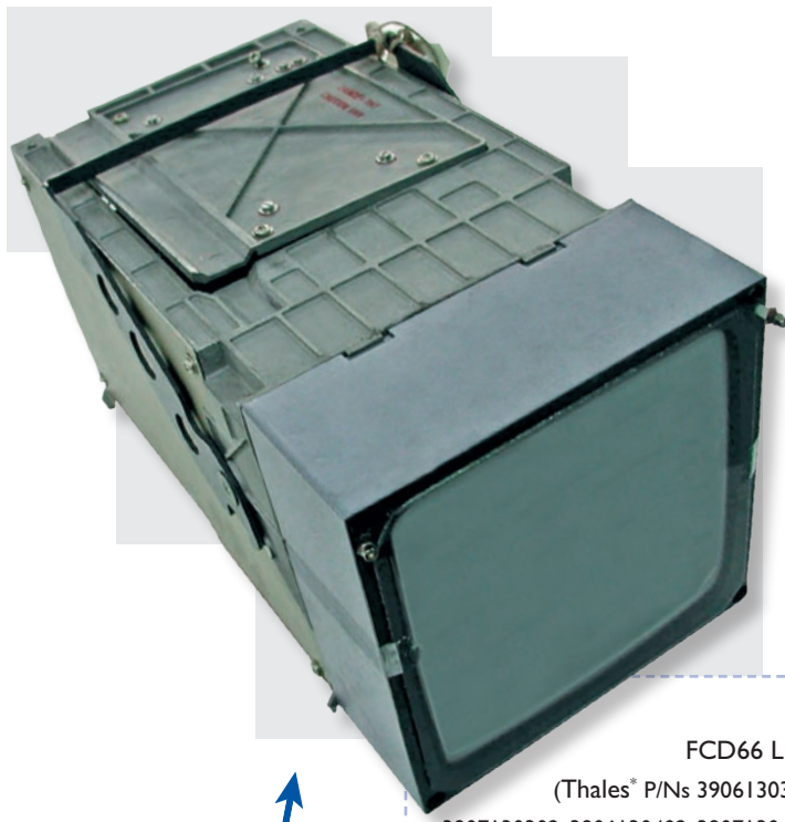
FCD66 LRU (Thales* P/Ns 3906130302, 3907130302, 3906130402, 3907130402, 45606101, 45606111, 45606112)

Thomas Electronics is pleased to offer a cost-effective, high quality repair solution for the Thales* FCD66 Display Unit, expanding Thomas' capability in Display Unit Support.